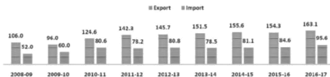
Chart 3: India's Services Trade